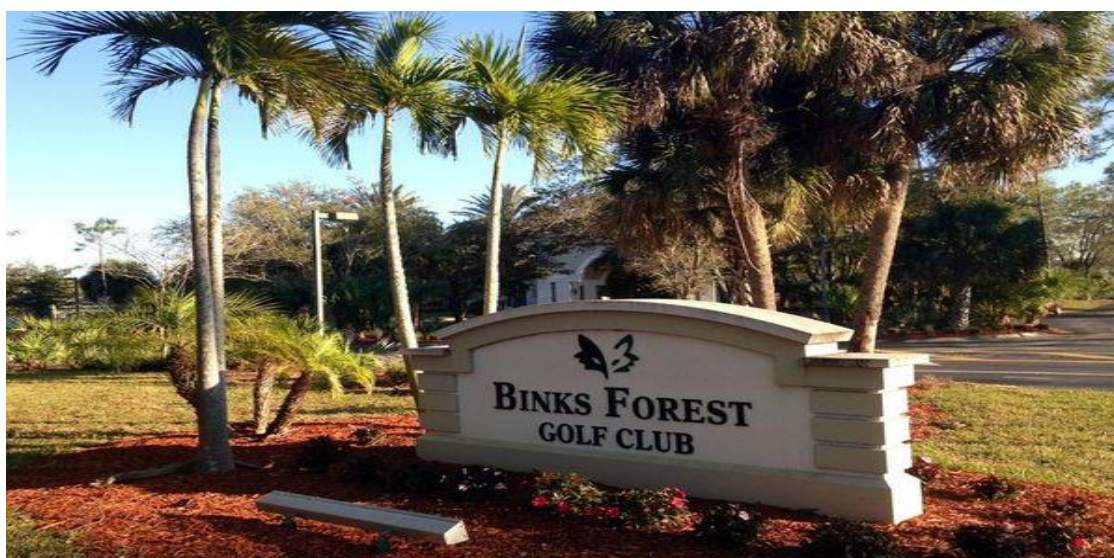
Illustration 9. BINKS FOREST GOLF CLUB