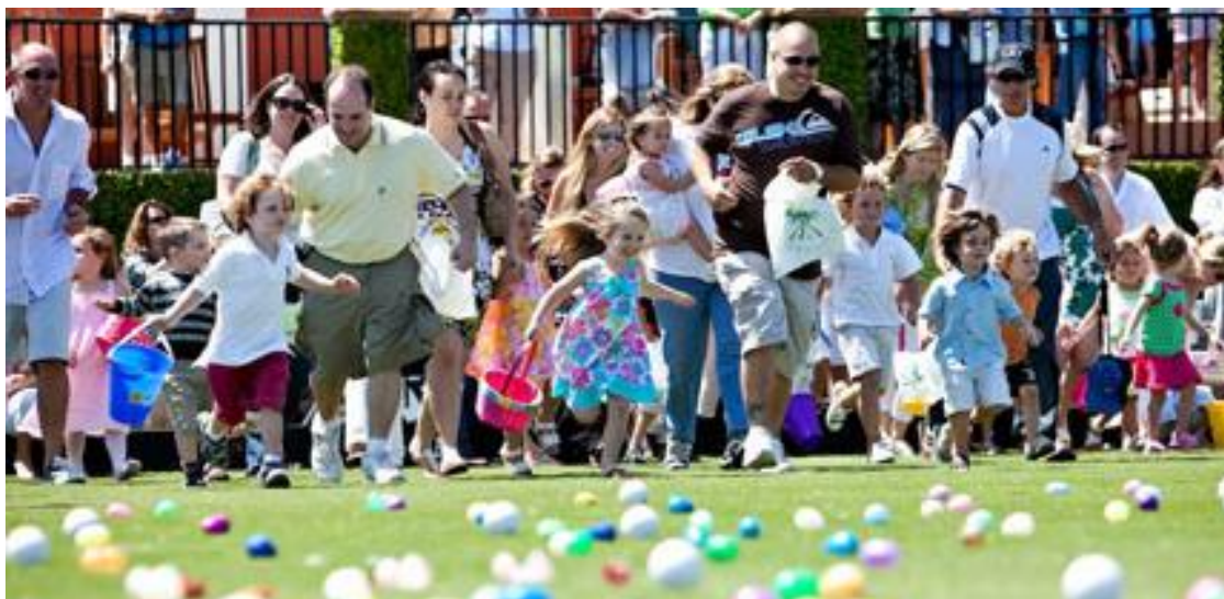
Illustration 12. EGG HUNT EVENT