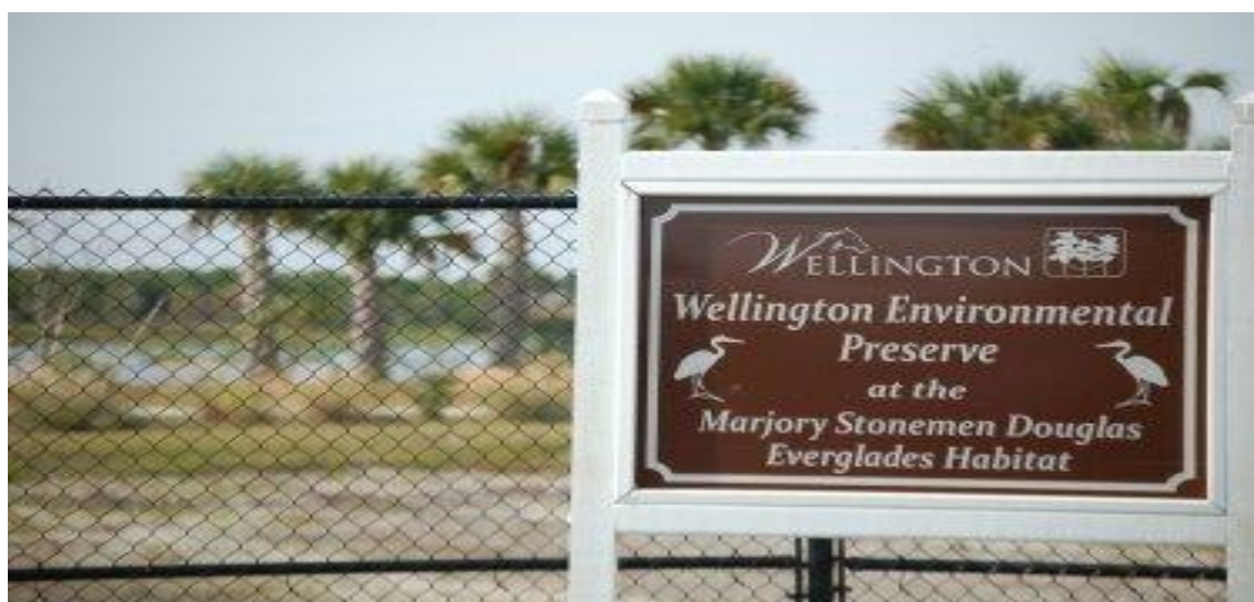
Illustration 4. THE WELLINGTON ENVIRONMENTAL PRESERVE