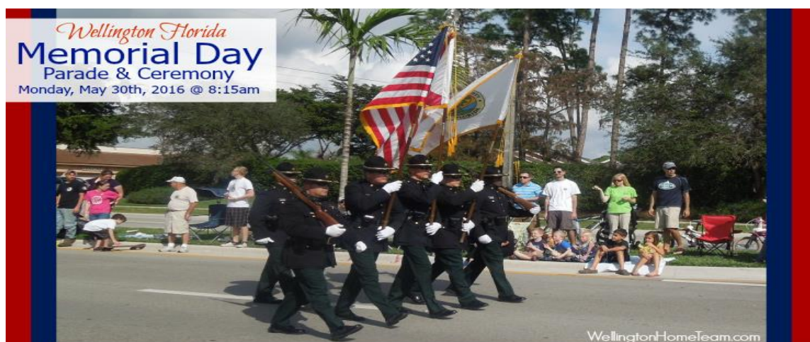
Illustration 13. MEMORIAL DAY EVENT

Each year, the Village of Wellington and the American Legion Chris Reyka Memorial Wellington Post 390 honor all veterans with a Memorial Day Ceremony. Veterans are invited to walk in a Memorial Day Parade beginning at 8:15 a.m. by Village Hall located at 12300 Forest Hill Boulevard. The parade ends at Wellington's Veterans Memorial located on the corner of Forest Hill Boulevard and South Shore Boulevard and will be followed at 8:30 am by the Memorial Day Ceremony.