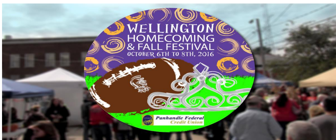
Illustration 16. FALL FESTIVAL

Wellington's annual Fall Festival event is held in October of each year at Village Park. In addition to the most popular "one-night-only" attraction, the Haunted Hallways, families and friends can enjoy: Trick-Or-Treating, Costume contests, Pie eating contests, Bounce houses, A petting zoo, Pony rides, Face painting, Food trucks, Vendors, and more.