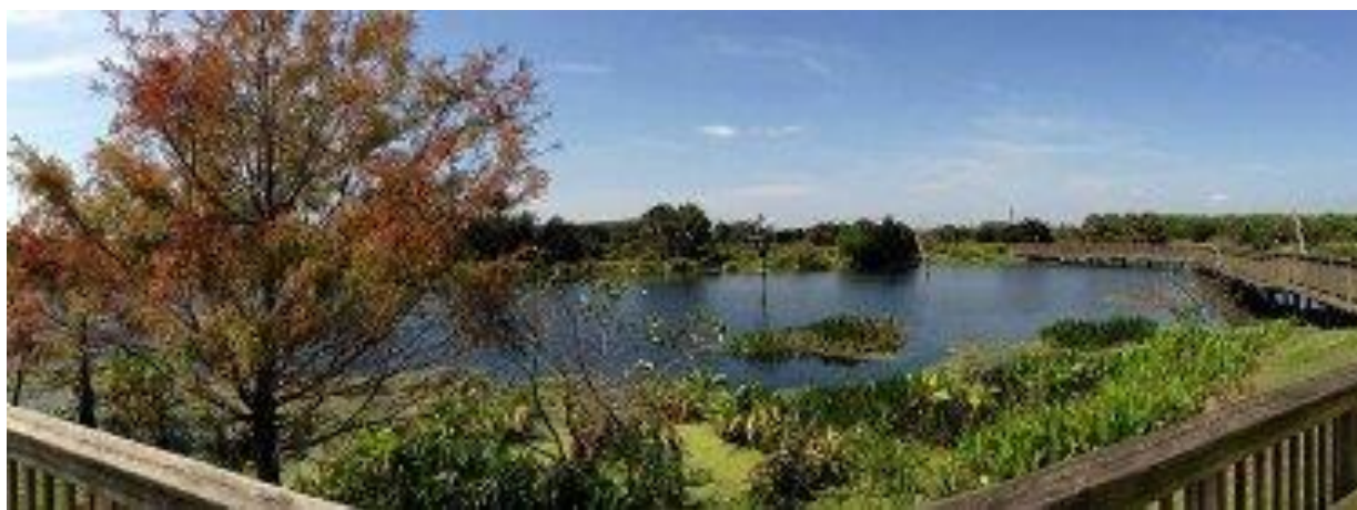
Illustration 3. PEACEFUL WATERS SANCTUARY