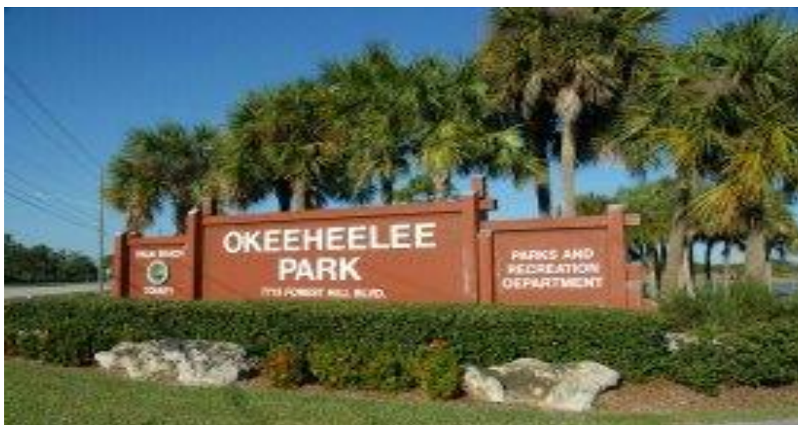
Illustration 5. OKEEHHEEL NATURE CENTER