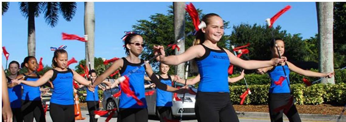
Illustration 14. JULY 4TH CELEBRATION

The fireworks at Village Park. Wellington's largest free event kicks off with live music and entertainment, bounce houses, face painting, a petting zoo, traditional games (pie eating, watermelon eating, hula hoops, egg toss, sack races, tug-o-war), food trucks, vendors, Free Bingo sponsored by Humana, Inc. and more. The evening is topped off with an incredible Zambelli Fireworks display at 9:15 p.m. Visible from Village Park and surrounding areas, this spectacular display will be sure to please the entire family. Music will also broadcast to add an extra level of flare to these fabulous fireworks. Free shuttle transportation service will be available from The Mall at Wellington Green at the Palm Tran bus stop beginning at 6 pm.