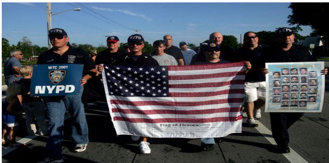
Illustration 15. 9/11 REMEMBRANCE CEREMONY

To honor the victims with a remembrance ceremony at the Patriot Memorial, located next to Village Hall at 12198 Forest Hill Boulevard. The Village Council will share their thoughts and lay a memorial wreath for those lost and affected by the attacks. The memorial includes one of the largest steel beams salvaged from the World Trade Center as well as an eternal flame, fountain and etched glass panels inscribed with the names of the victims.