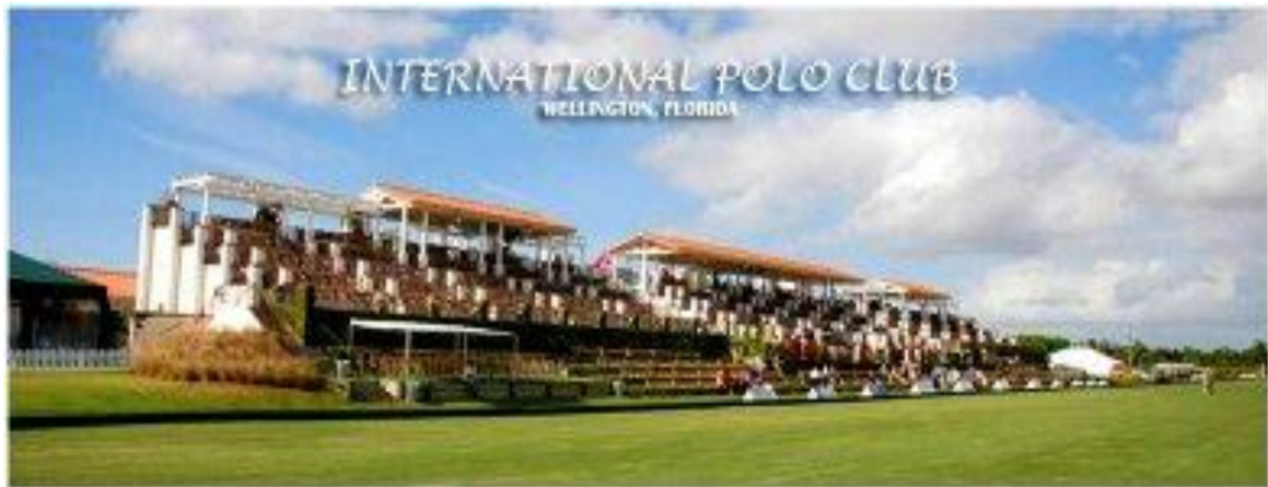
Illustration 6. THE INTERNATIONAL POLO CLUB