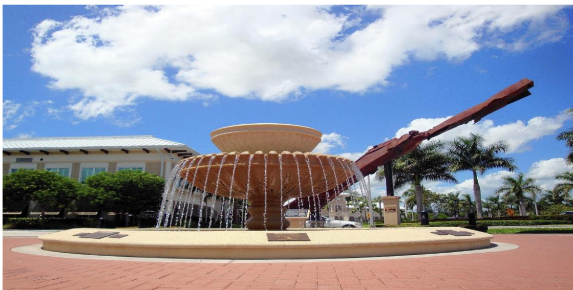
Illustration 10. PATRIOT MEMORIES

The Patriot Memorial remembers and honors the nearly three thousand people who died in the terrible attacks on September 11th, 2001 at the World Trade Center, at the Pentagon, and in a quiet field in Shanksville, Pennsylvania. Over 400 first responders perished heroically that day performing their sworn duty. It is because of these facts that the Wellington Community Foundation, a non-profit organization, and the City of Wellington have chosen to accept the responsibility to commemorate 9/11, which extends to the family and friends who lost loved ones, to those who survived, and to those people who will come to visit this site. The Memorial was created for people to come and honor those who died on September 11th and reflect on the humanity of the after effects, and to admire all public safety professionals who have the courage to risk their lives to save others. The world remembers how we came together in the aftermath of September 11th.