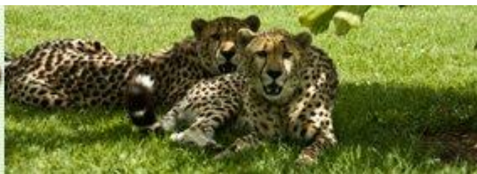
Illustration 2. PANTHER RIDGE CONSERVATION CENTER