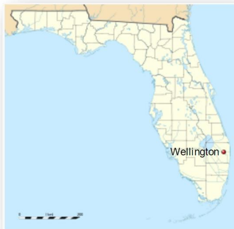
Illustration 1. GEOGRAPHICAL LOCATION OF WELLINGTON – FLORIDA.

The Village of Wellington is located in the westernmost part of Palm Beach County, sharing a southwestern boundary with the Florida Everglades. Wellington balances a unique hometown/family atmosphere; with an attractive natural environment and has recreational, cultural, and educational activities for all ages of its population. Wellington is one of the most successfully crafted communities in Palm Beach County. It has become the premier community in South Florida; it is known for its abundant parks, quality schools, attractive neighborhoods, and equestrian interests.