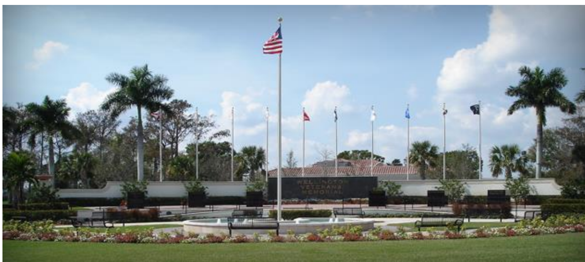
Illustration 11. VETERANS MEMORIAL

The Veterans Memorial is located at the intersection of South Shore Boulevard and Forest Hill Boulevard. This memorial is dedicated to all veterans who served honorably in the military in wartime or peacetime. Law enforcement and fire rescue personnel are also honored for risking their lives for our safety. Monuments for each war and conflict along with various flags representing the Armed Forces, POW's, Palm Beach County, Wellington and the State of Florida surround a beautiful fountain. The Park celebrates the achievements and spirit of all service men and women.