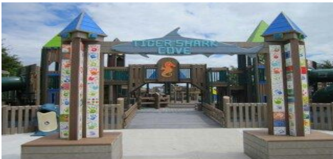
Illustration 8. TIGER SHARK COVE