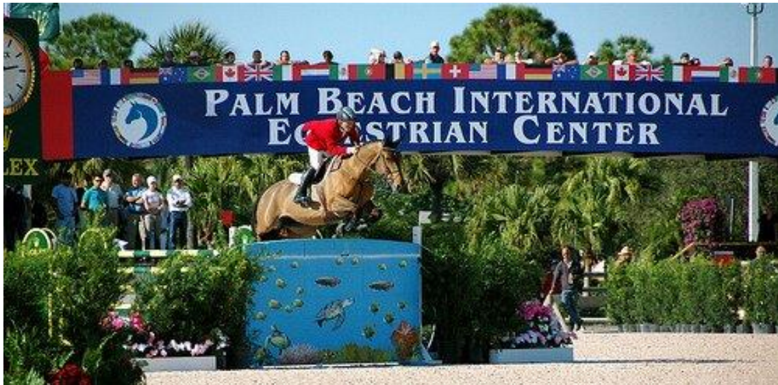
Illustration 7. THE PALM BEACH INTERNATIONAL EQUESTRIAN CENTER

The Palm Beach International Equestrian Center (PBIEC) is considered the most recognizable equestrian sporting venue in America today. It is a 160-acre “Equestrian Lifestyle Destination” nestled in the heart of an 8,000-acre equestrian paradise in Wellington. There are 12 competition rings throughout the equestrian show complex suited for show jumping, hunter, dressage, western/trail riding, driving and polo. The surface of the competition arenas, also known as footing, has been upgraded to Olympic quality, drainage was rebuilt through the facility, and a new vendor village has been added. Classes are also held at The Stadium, which features a grass derby field and a refreshing change of pace for exhibitors and spectators. This world-class venue is home of the 2013 FTI Consulting Winter Equestrian Festival, which draws the elite equestrian riders from around the world. International and Olympic equestrians join to compete and thrill spectators with their pageantry and athleticism.