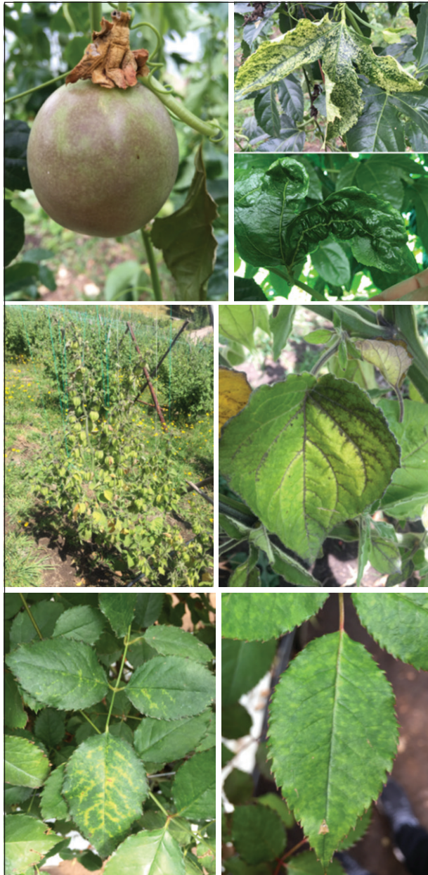
Figure 2. Characteristic symptoms associated with plant virus infection. Row 1: purple passion fruit with discoloration (left), leaf with mosaic (right top) and blistering (right below). Row 2: cape gooseberry with yellow and stunting (left) and vein necrosis (right). Row 3: ornamental rose leaf with oak leaf pattern (left) and mottling (right).

antibody and confirmed to be Soybean mosaic virus by using a species specific antibody which was recently developed by BIOREBA to be applied in passion fruit. The four samples, each representing an individual plant, came from two different farms.